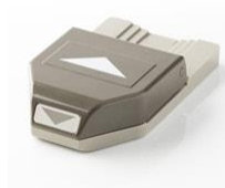
Banner Triple Punch [138292]