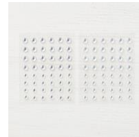
Frosted & Clear Epoxy Droplets [147801]