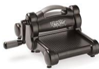
Big Shot [143263]