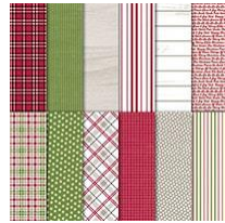
Festive Farmhouse 12" X 12" (30.5 X 30.5 Cm) Designer Series Paper [147820]