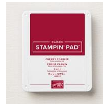
Cherry Cobbler Classic Stampin' Pad [147083]