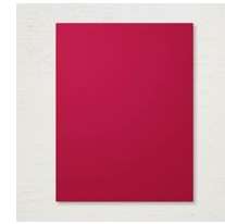
Cherry Cobbler 8-1/2" X 11" Card Stock [119685]