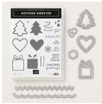
Nothing Sweeter Photopolymer Bundle [149955]

Apply the Current Rewards Code to your order for free gifts from me!