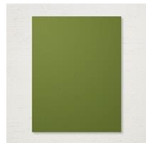
Mossy Meadow 8-1/2" X 11" Cardstock [133676]