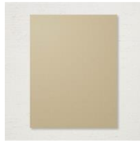
Crumb Cake 8-1/2" X 11" Card Stock [120953]