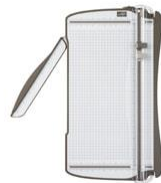
Stampin' Trimmer [126889]