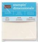
Stampin' Dimensionals [104430]