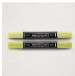
Granny Apple Green