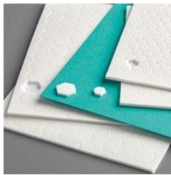
Mini Stampin' Dimensionals [144108]