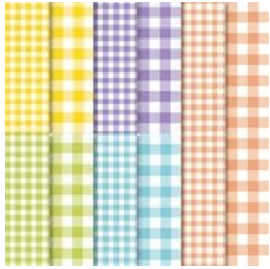
Gingham Gala 6" X 6" (15.2 X 15.2 Cm) Designer Series Paper [148554]