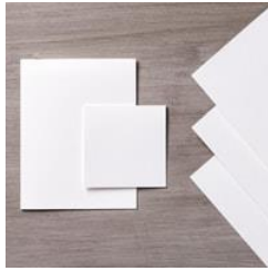
Whisper White 8-1/2" X 11" Thick Cardstock [140272]