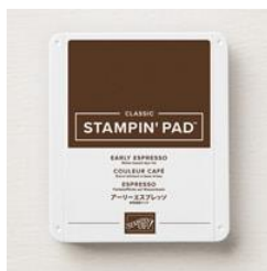
Early Espresso Classic