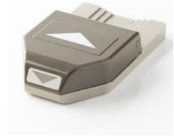
Banner Triple Punch [138292]