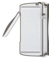
Stampin' Trimmer [126889]