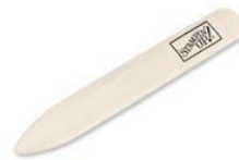
Bone Folder [102300]